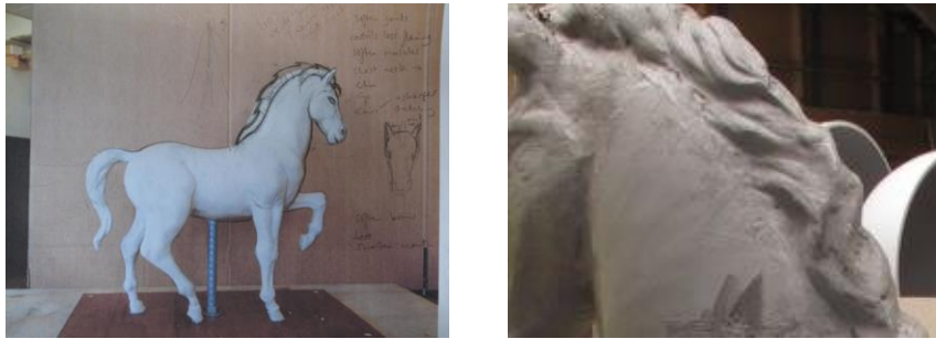
Left: over-drawing on image of maquette by Caio Locke. Right: detail of clay sculpture in progress

This was achieved at the maquette stage through discussions with the clay sculptor, and a divergence away from the rigid Greco-Roman style, to create a waved, flowing mane. At this point, a flow and continuity through the horse was achieved by stylistically linking mane and tail.