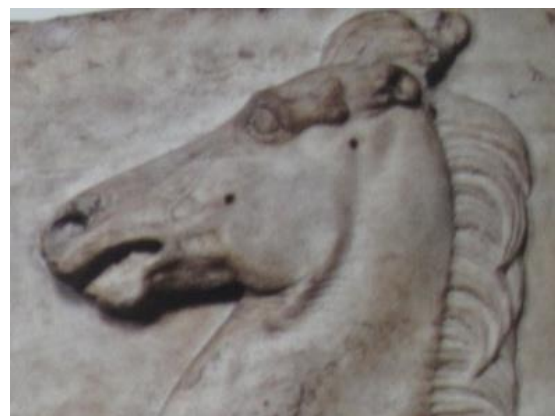
Left: Da Vinci sketch. Right: Stone carving, west frieze of Parthenon

However, the muscle definition of the Chakravarty Cup horse has been softened to allow for artists to work onto the shape. Further, the abstraction to the neck of the Da Vinci horse, by virtue of its apparent extension by two vertebrae, has not been followed, since a sense of balance was paramount, and the slowly pacing pose did not require such a bowed head.