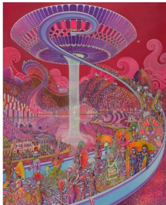
'Kingdom Crossing' (2006) and Niemeyer Landing (2010), acrylic on canvas by Caio Locke